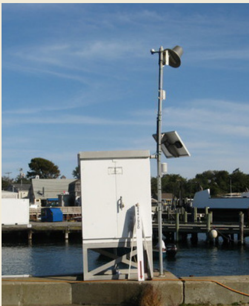
Tide station at Woods Hole, Massachusetts

NTDE data is provided by tide/water level stations that make up the National Water Level Observation Network (NWLON). While all NWLON stations provide some data, not all have data that span the