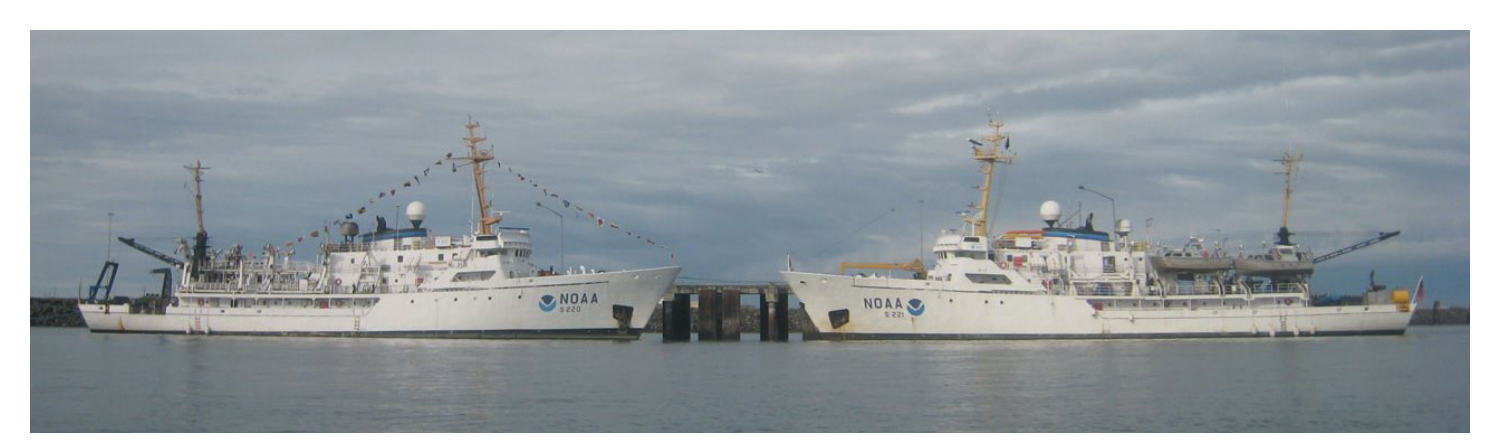
NOAA ships Rainier and Fairweather were built in 1968 with an original design life of 30 years. Each ship carries five survey launches. Dedicated ships carrying multiple survey launches are one of the most efficient and cost-effective ways to conduct hydrographic surveys. Both vessels still conduct annual surveys in challenging Alaskan and Arctic waters.

Unscheduled maintenance days for NOAA ships Rainier and Fairweather greatly affect the amount of surveying that can be accomplished.