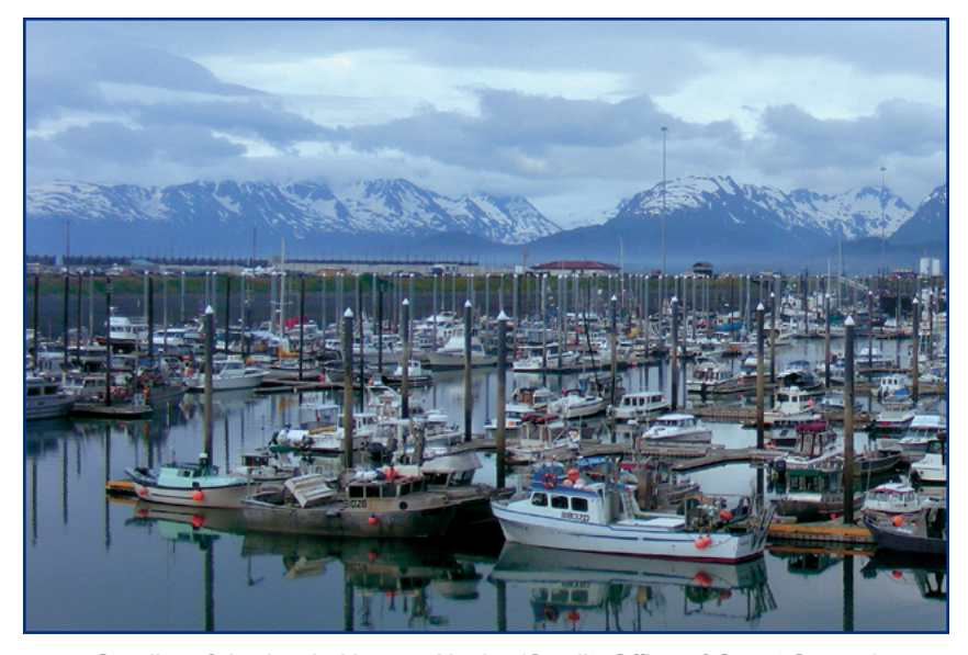
Small-craft harbor in Homer, Alaska

Is the information current and accurate?