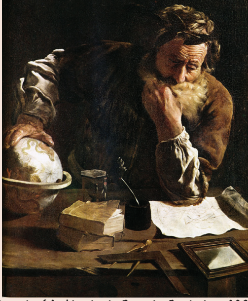
Portrait of Archimedes, by Pomenico Fetti, about 1620

http://www.thirteen.org/edonline/nttidb/lessons/jx/buoyjx.html for more boat building challenge ideas.