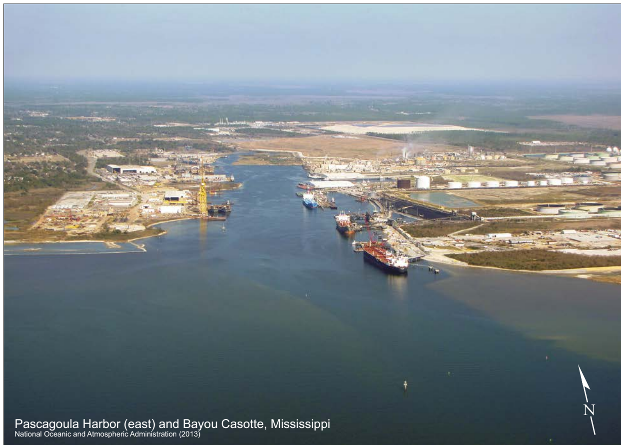
Pascagoula Harbor (east) and Bayou Casotte, Mississippi National Oceanic and Atmospheric Administration (2013)

and by avoiding the breakers during rough weather. A lighted buoy is at the north end of the pass. The chart and knowledge of local conditions are the best guides.